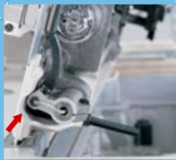
Feed eccentric pin

In addition, the machine is provided with a mounting seat for attachment to improve workability while replacing the attachment and increasing the durability of the machine bed surface.