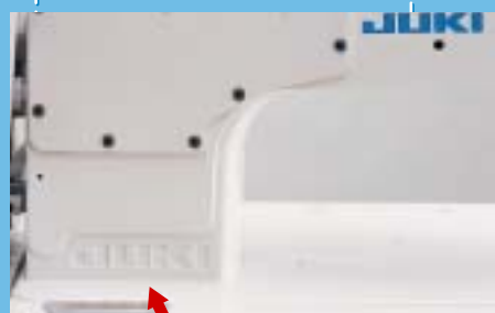
Embossed JUKI mark